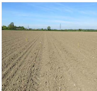
Photo 2. Kerseys Field