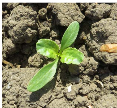
Photo 1. Barn Field Sugar Beet